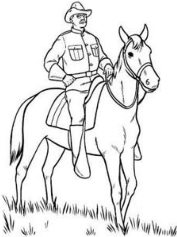
Theodore Roosevelt became known as the colonial of the "Rough Riders" who led the charge up San Juan Hill in the Spanish American War. He became President after McKinley's death and was re-elected in 1904.